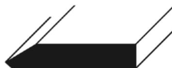
Steep Angle, Reverse Bevel